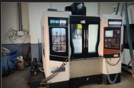
Cosmos CVM 640