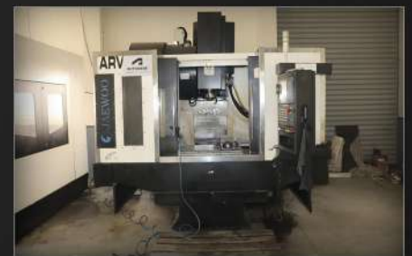
Jaewoo ARV 800