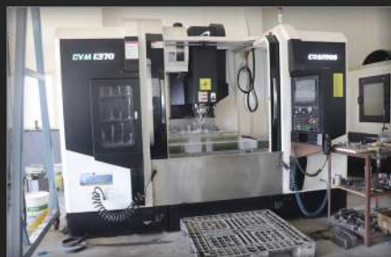
Cosmos CVM 1370